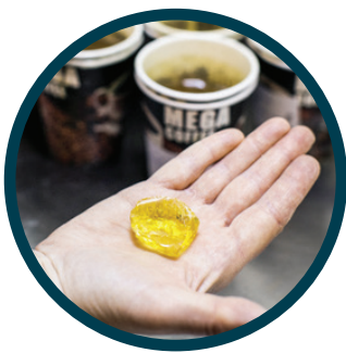
Yellow gold, tall diesel, vehicle fuel from the forest.

Sveaskog's involvement in a project to enable longer and heavier vehicles continued in 2018. On 1 July, part of the national road network was opened for the new bearing capacity BK4 which permits HGVs of up to 74 tonnes compared with the previous limit of 64 tonnes. So far only 12% of the road network is open for heavier vehicles but the ambition is to open the entire road network. This has motivated continued efforts for Sveaskog since the climate benefit is considerable when the same volume of timber can be transported with significantly fewer vehicles.