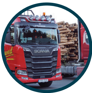
Both forestry and the climate benefit from longer and heavier vehicles.

In its development projects, Sveaskog collaborates with other players from universities, forestry, the transport sector, the vehicle fuel sector, etc. Projects are usually multi-year and Sveaskog's bond was used to finance investments during 2017. A summary of how work on some of these projects has progressed is provided below.